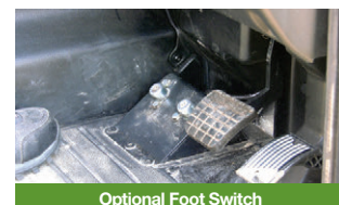
Optional Foot Switch

In addition to standard joystick functionality, H.A.L.O. is also available in optional foot switch buttons and can be added to outside cab controls.