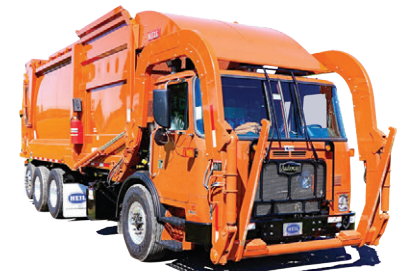
Available in lightweight Freedom body package