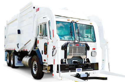
Available with Curotto® commercial grabbers