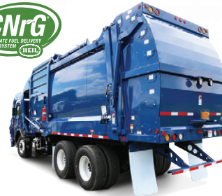
Available with optional CNRG® Tailgate