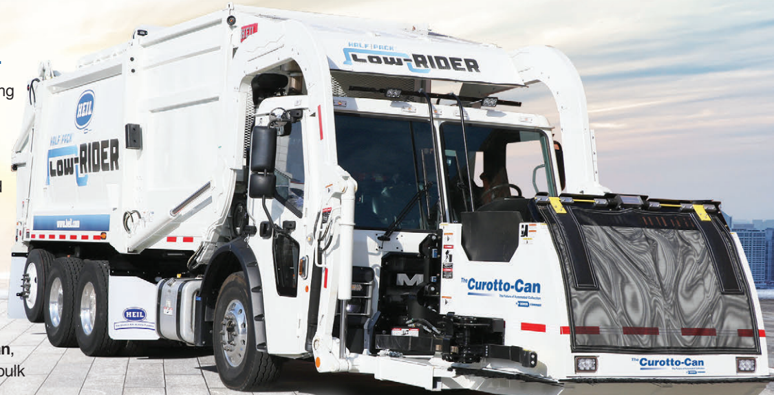
Shown with optional Half/Pack® LowRider™ Body and Curotto-Can® Residential Package

* Heil does not provide tax advice. Please consult your tax advisor regarding the specific tax implications of your selected product.