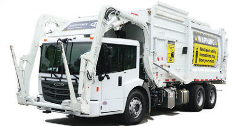
Available with articulating arms for EonicSD chassis