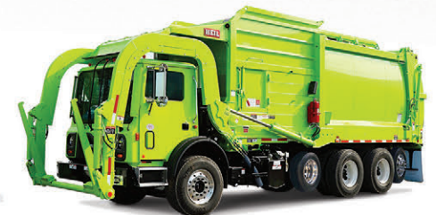
Available with 5-axle configuration