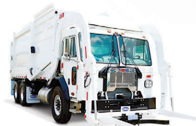
Available with commercial grabbers