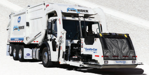
Optional Curotto-Can® Residential Package