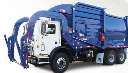
Available in 20 yard body configuration